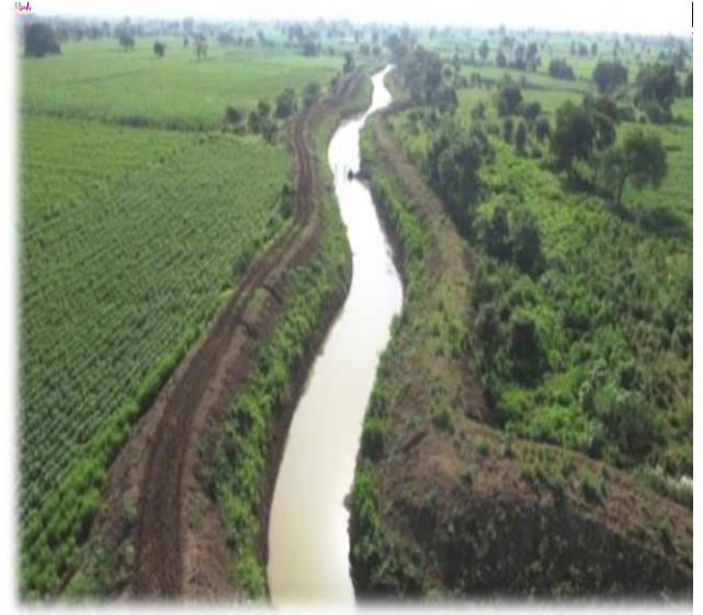
Satoda Nala- Dist Wardha – Nalla Deepening